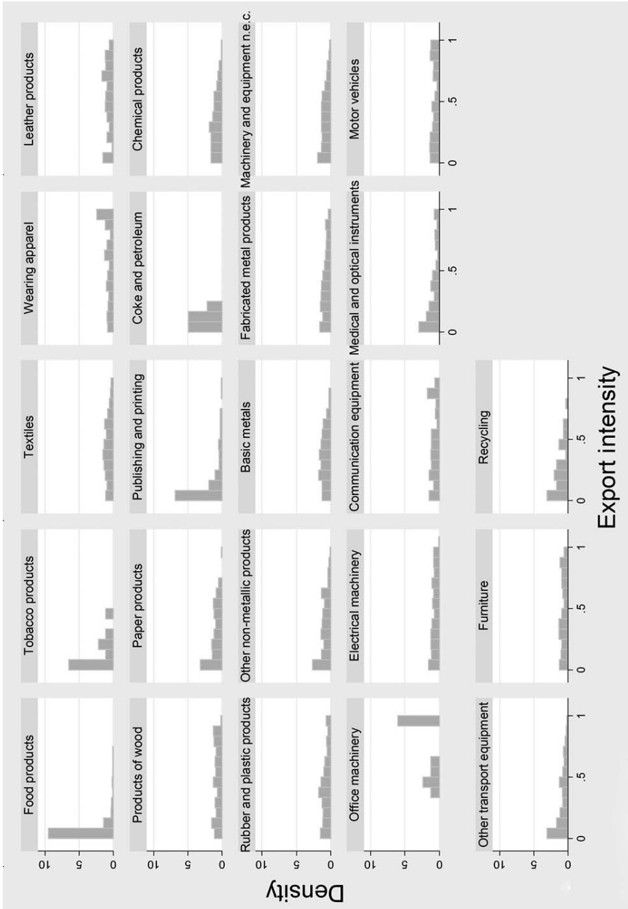
Figure 1 - Histograms of export intensity (for individual industries, exporters only)