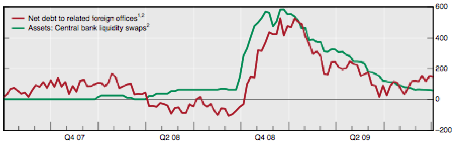
Graph 11.1 US commercial banks' net debt to related foreign offices and Fed swaps outstanding In billions of US dollars